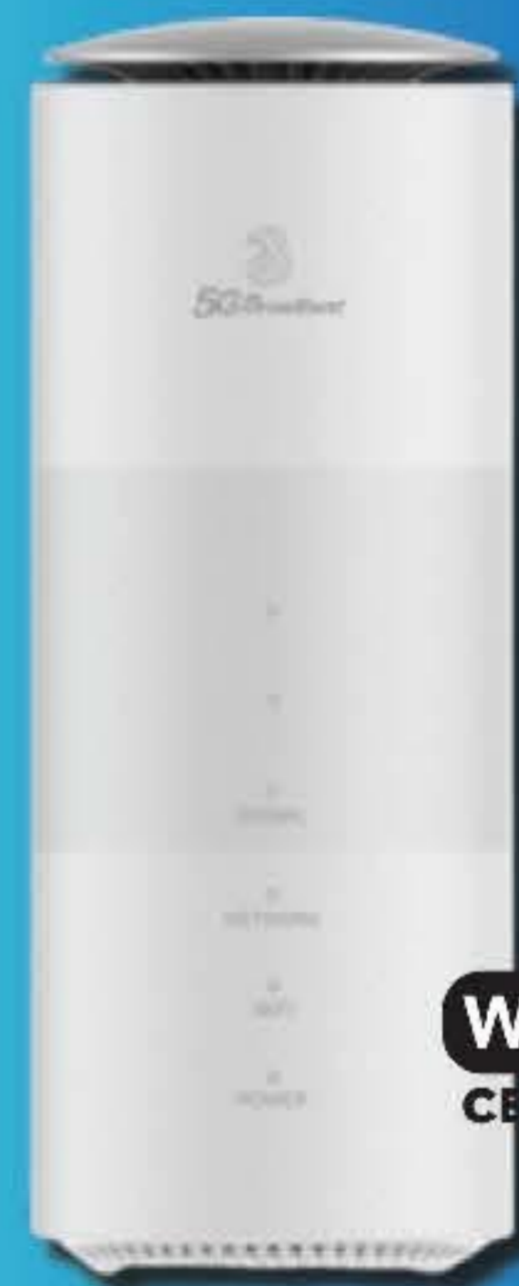
3HK 5G CPE 5